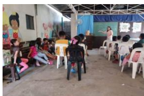
CBC Children's Church