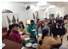
Christmas Celebration 2022