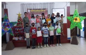
CBDA Christmas Party 2022