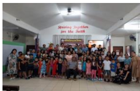
CBC Christmas Party 2022